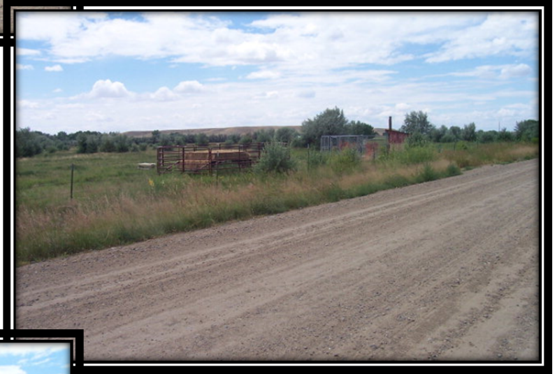
View to the West