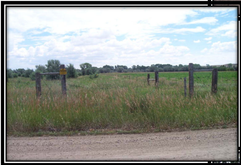
West property line