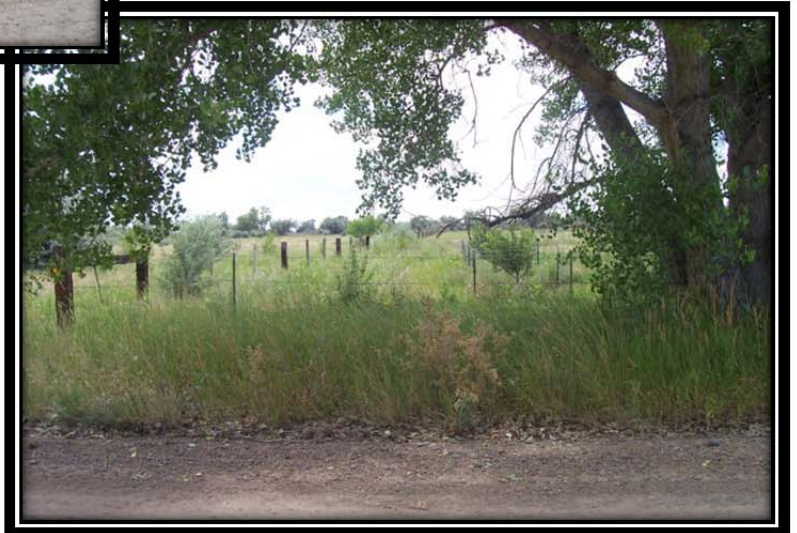
East property line